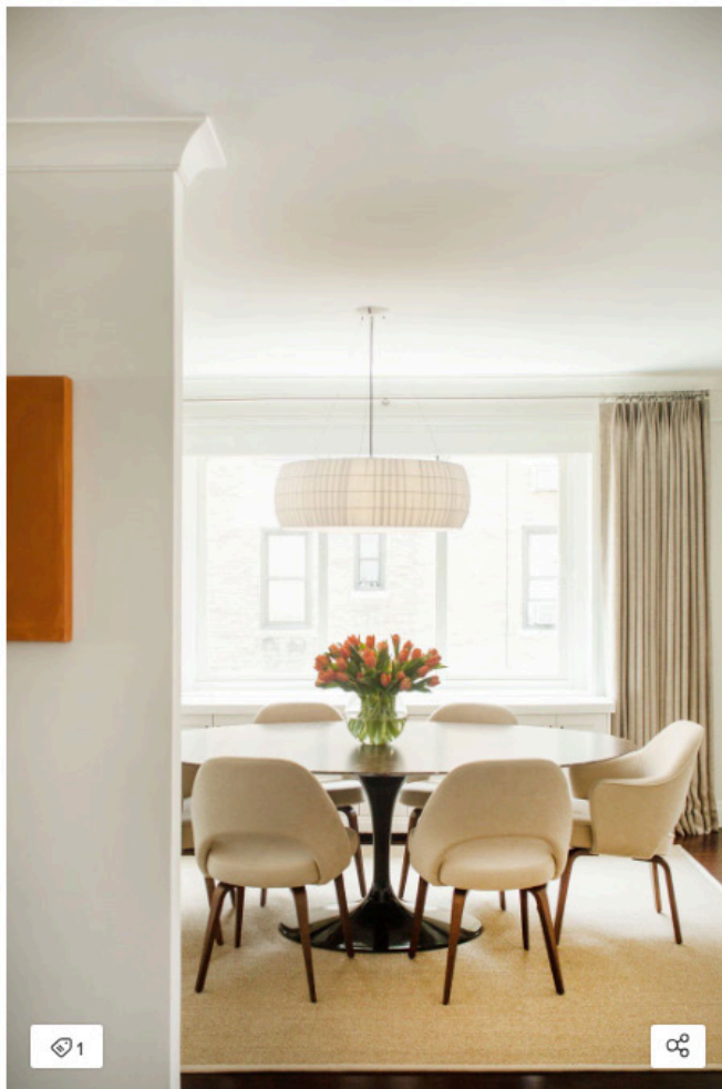
Madison Avenue Duplex

I spent a lot of time traveling with my parents and going to concerts growing up, and I got to see some great spaces as a kid.