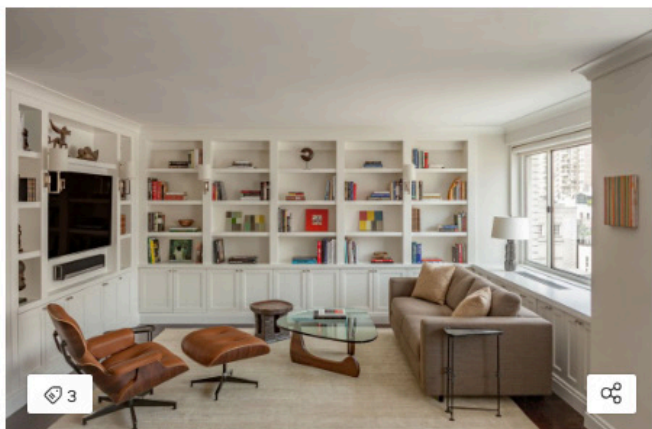
Madison Avenue Duplex

I think it has helped me appreciate good craftsmanship. Keeping things simple, and giving natural materials a chance to shine. Most Brazilian design also has a certain warmth and playfulness to it. It is not too austere.