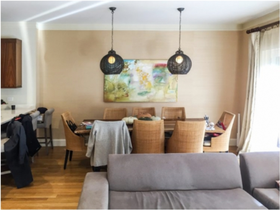
Dining Room: Before