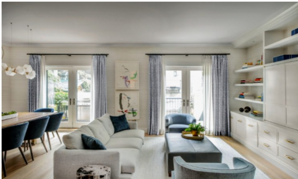
Living Room: After