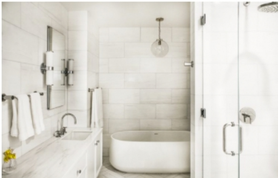
Master Bathroom: After