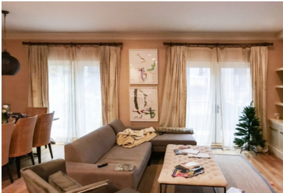
Living Room: Before