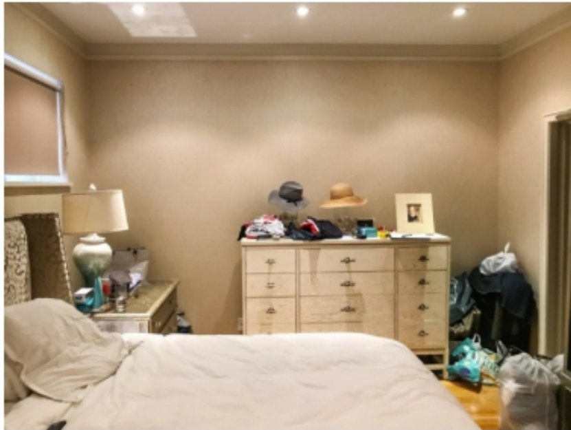
Master Bedroom: Before