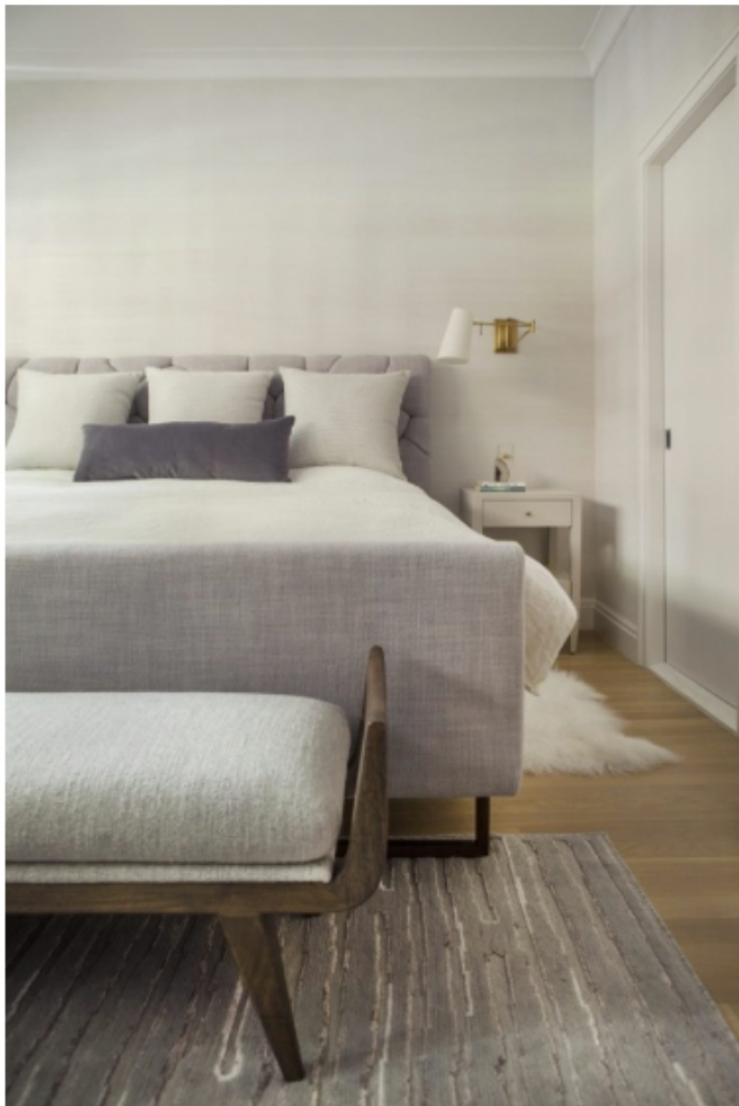
Master Bedroom: After