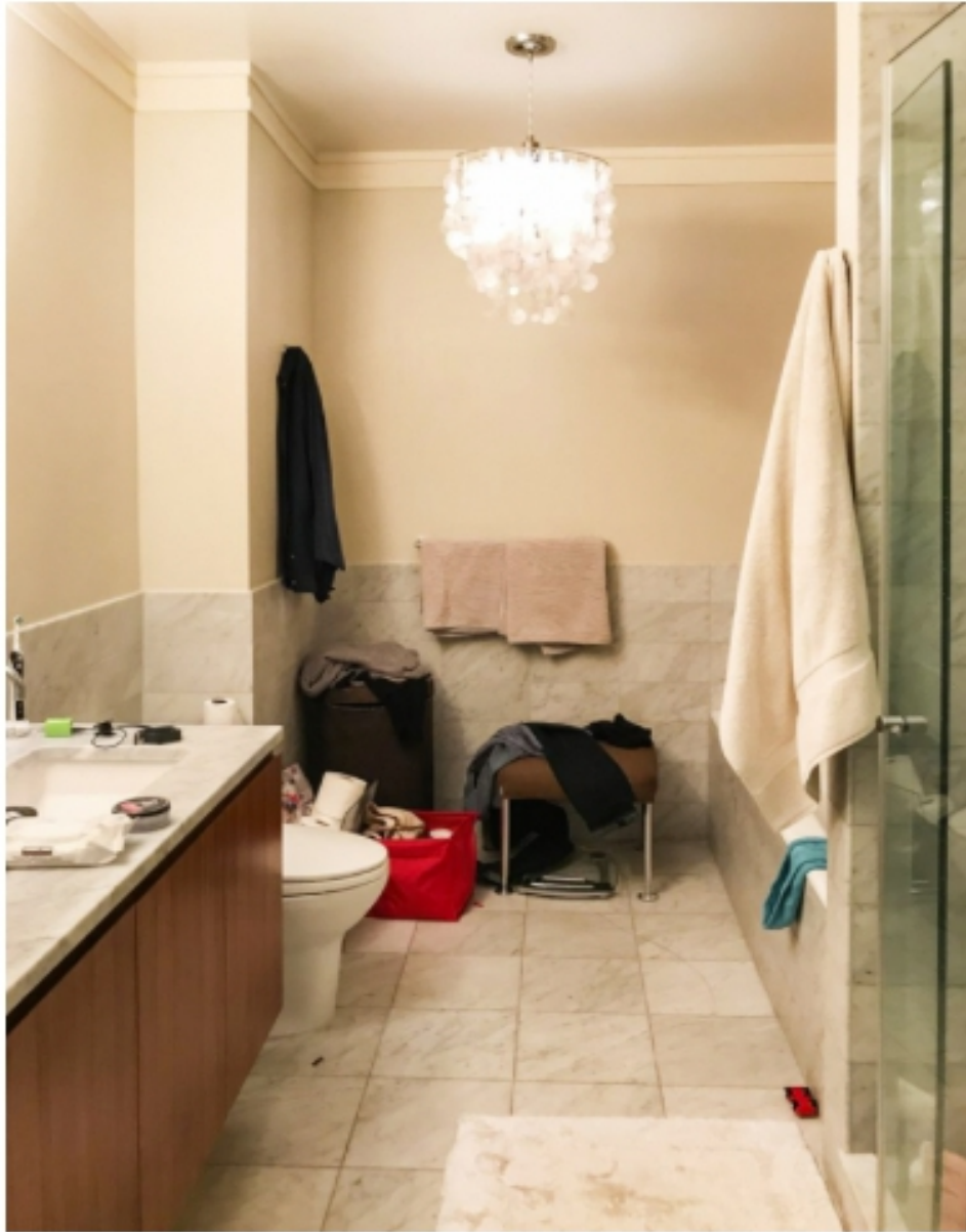
Master Bathroom: Before