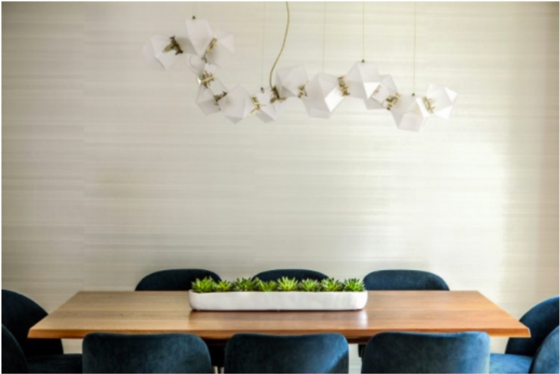
Dining Room: After